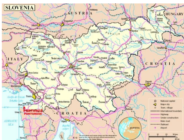
Map of Slovenia