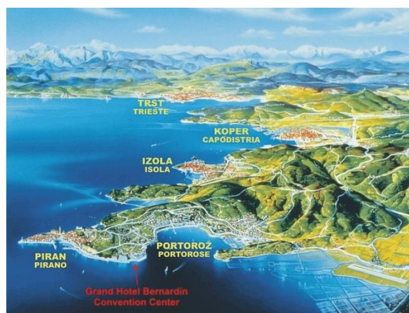
Panorama of the Slovene coast